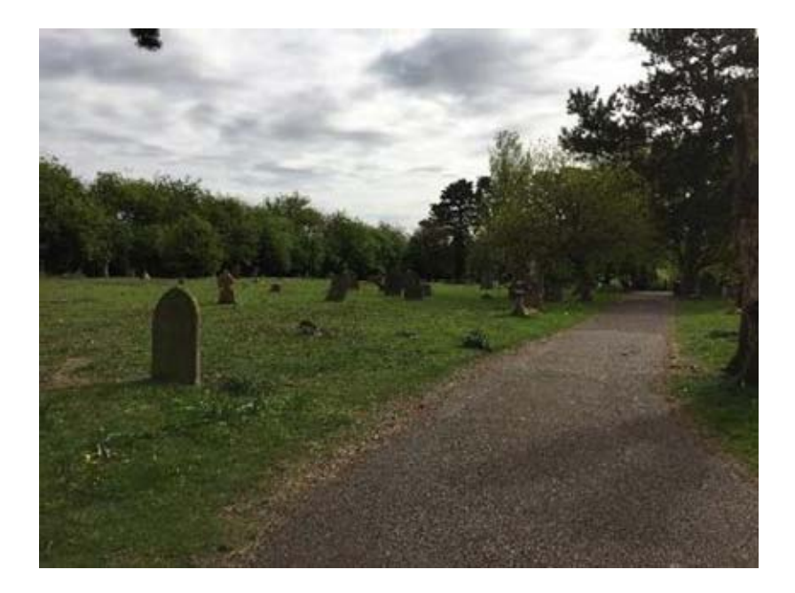
Debenham cemetery looking north east.