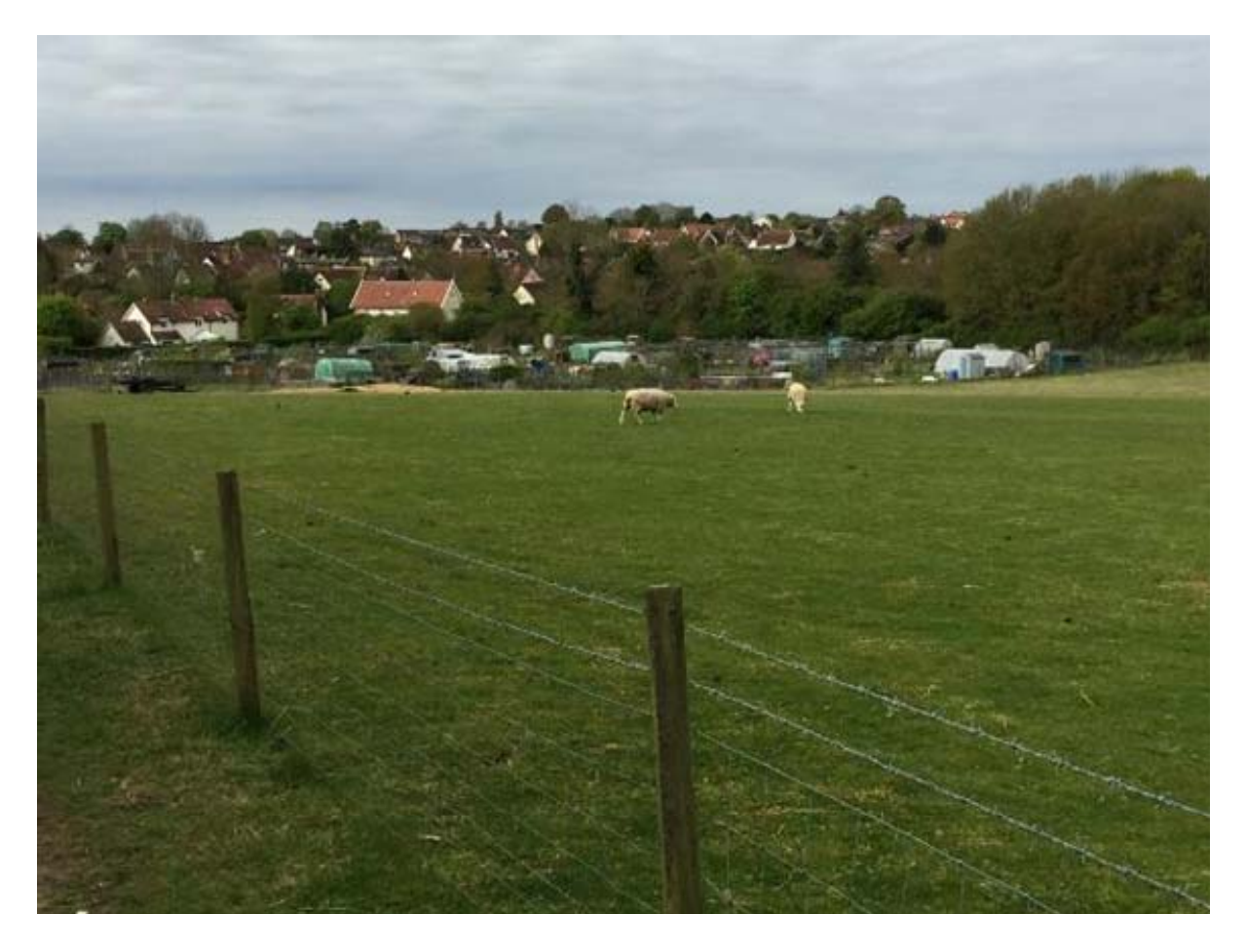
The Debenham allotment field with sheep grazing at the north (higher) end of the field.