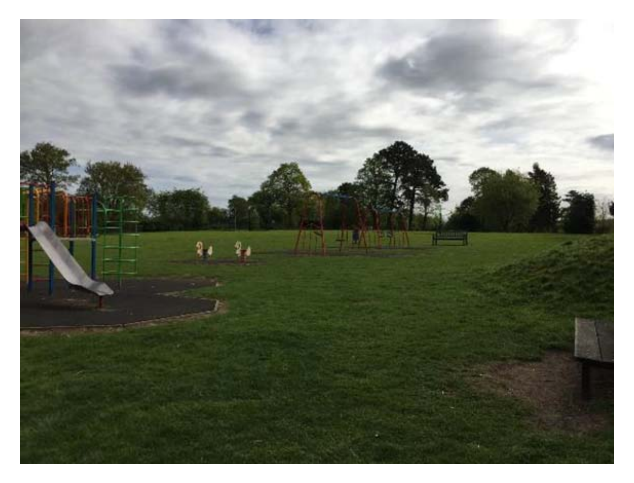
The children's play area at the recreation ground.