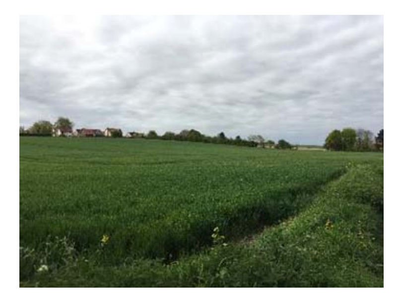
The open fields to the south of the Butts, looking towards the High School from the Butts.